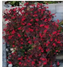
Euphorbia Jerry's Choice Ⓞ