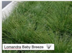
Lomandra Baby Breeze ▾