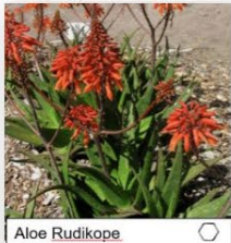
Aloe Rudikope ○