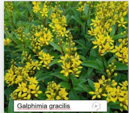
Galphimia gracilis {X}