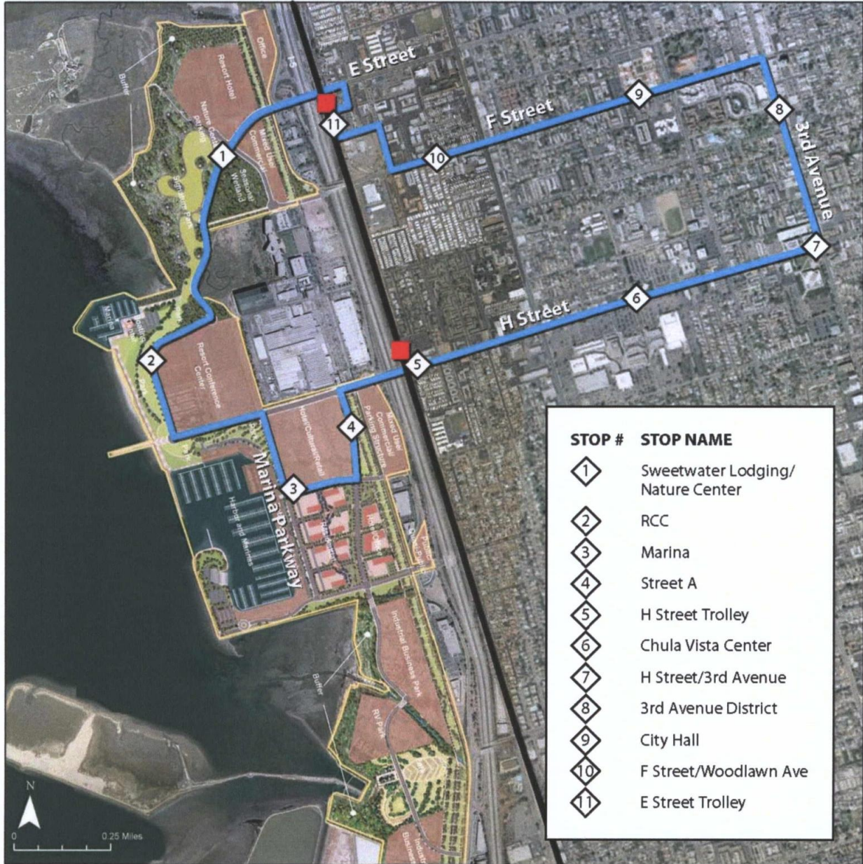
Exhibit 4 – Chula Vista Bayfront Shuttle