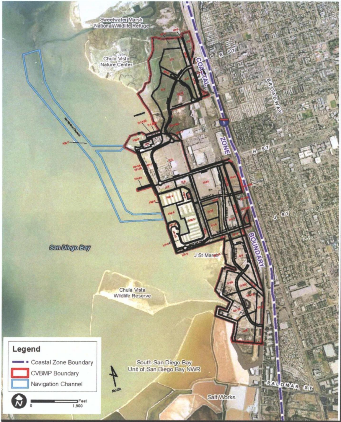
Exhibit 1 – Chula Vista Coastal Zone