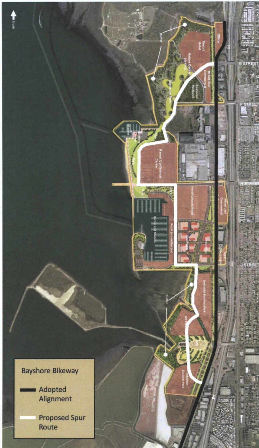
Exhibit 3 – Bayshore Bikeway