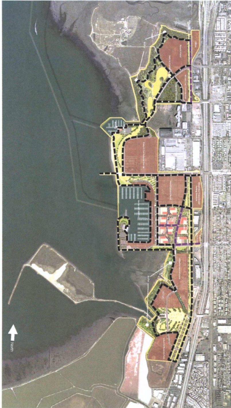
Exhibit 2 – Pedestrian Circulation Plan