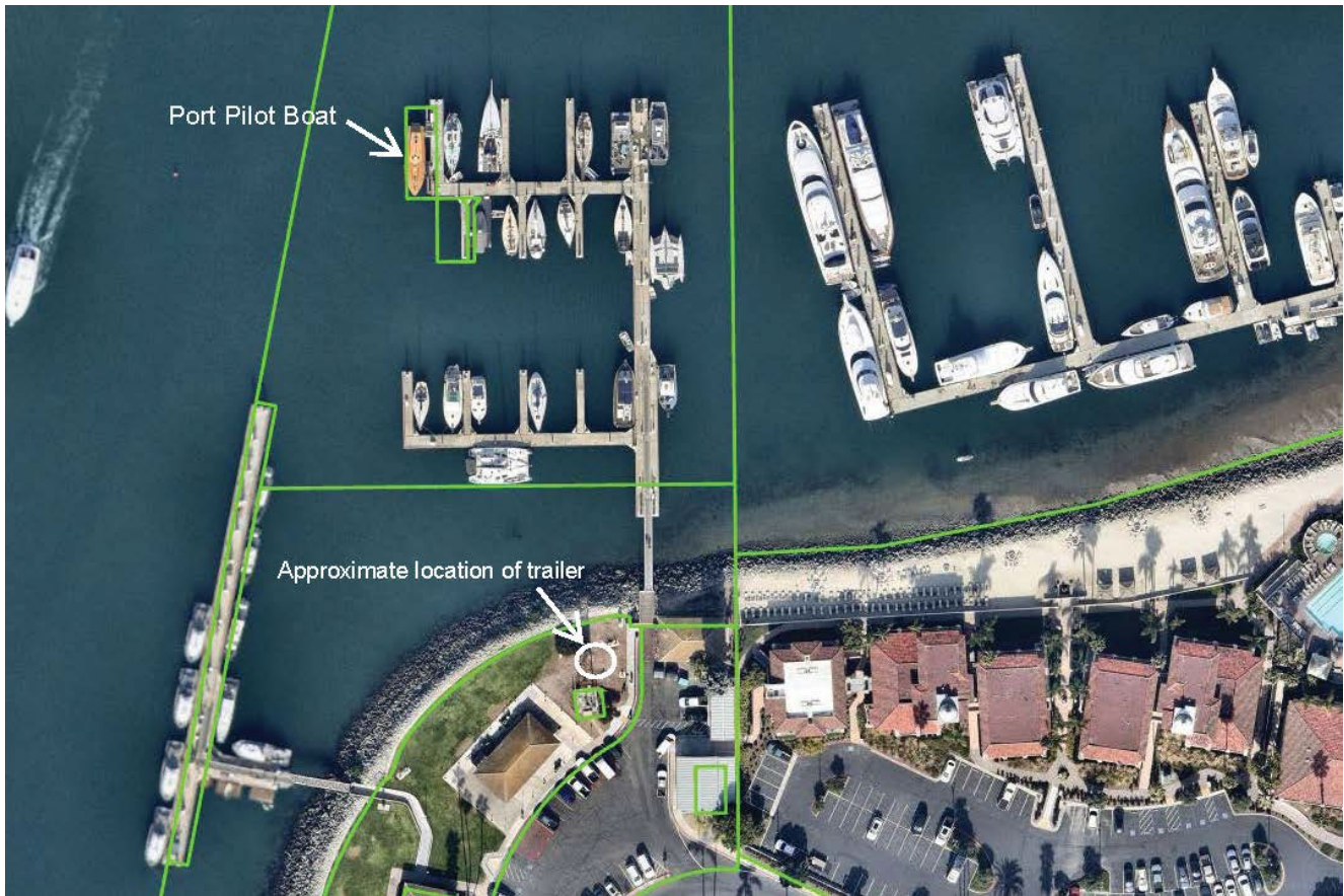
Figure 2. Approximate dimensions and location of proposed interim Port Pilot Station.